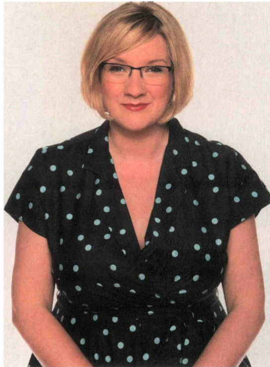
EXTRACTED FROM THE BOOBYTRAP AND OTHER BITS AND BOOBS (HOT KEY BOOKS, £7.99). A DONATION FROM THE SALE OF EACH BOOK WILL GO TO BREAST CANCER CHARITIES.

Source: Good Housekeeping {Main} Edition: Country: UK Date: Friday 1, November 2013 Page: 82 Area: 389 sq. cm Circulation: ABC 395661 Monthly Ad data: page rate £17,391.00, scc rate £88.00 Phone: 020 7439 5000 Keyword: Hot Key Books